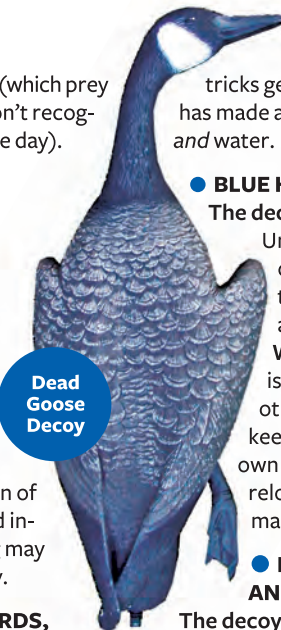
Dead Goose Decoy

Why consider it: Though this fake six-foot snake is about as primitive as decoys get, the manufacturer claims it helps reduce fruit-tree and vegetable-crop losses by up to 50 percent.